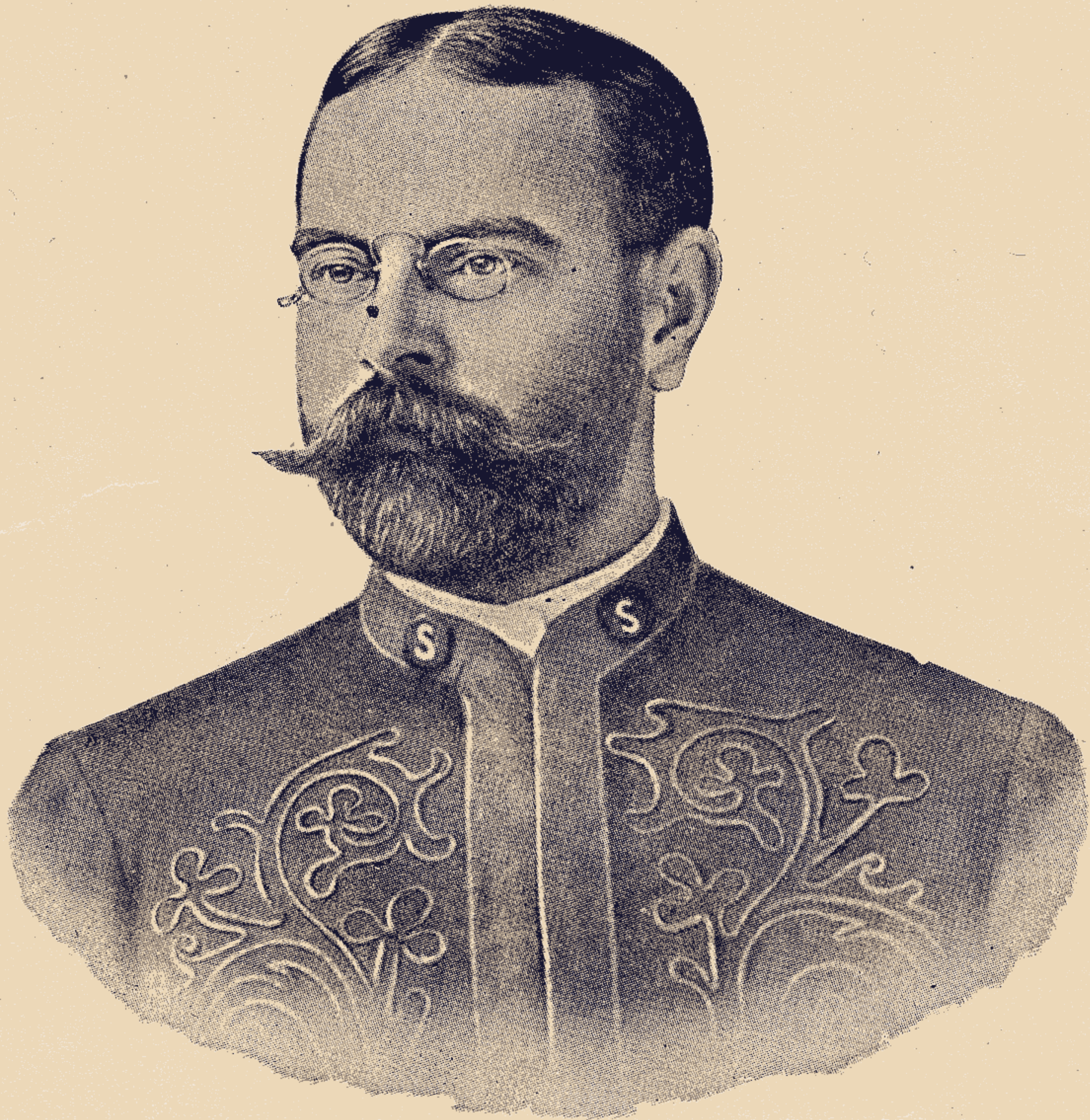
JOHN PHILIP SOUSA.

..... AS PLAYED BY ..... Sousa's Peerless Band.